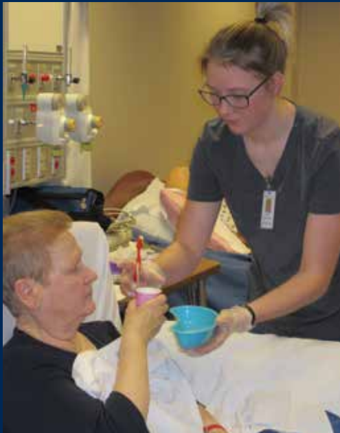
Persevering To Provide Excellent Education Page 12